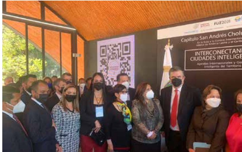
LAB SAN ANDRÉS CHOLULA, PUEBLA