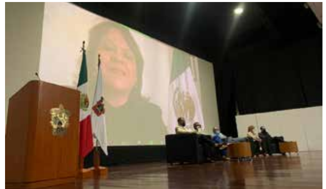
PUERTO VALLARTA, JALISCO